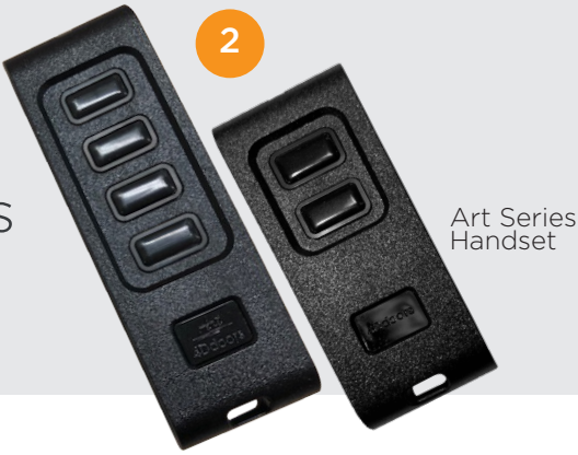
Art Series Handset