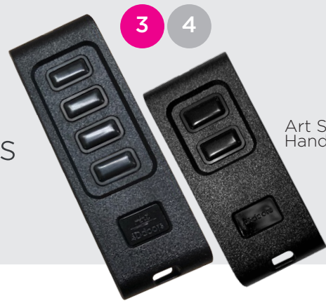
Art Series Handset