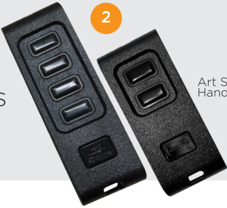
Art Series Handset